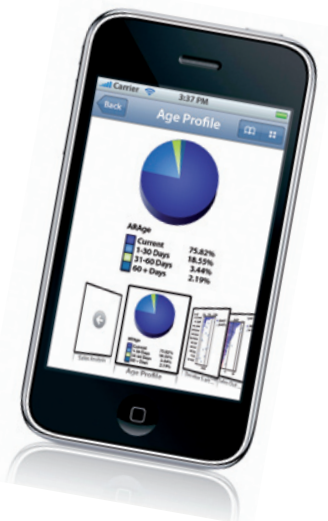
QlikView for iPhone

Fully-functional free QlikView Developer for Personal Use, and seeing is believing experience